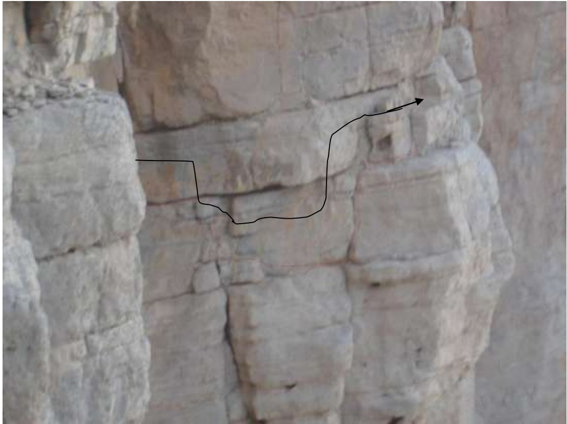
The great escape out right.