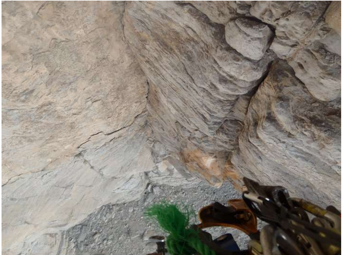
Looking down the second pitch