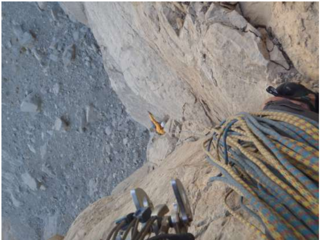
Ralph climbing the awkward groove. Looking down from the hanging stance of the first belay.